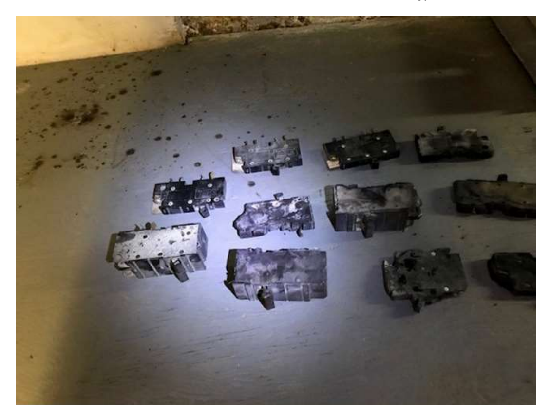
Photo of the damaged breakers that were installed within the load center

A photo taken post incident after rapid release of electrical energy and the cut out fuse activating