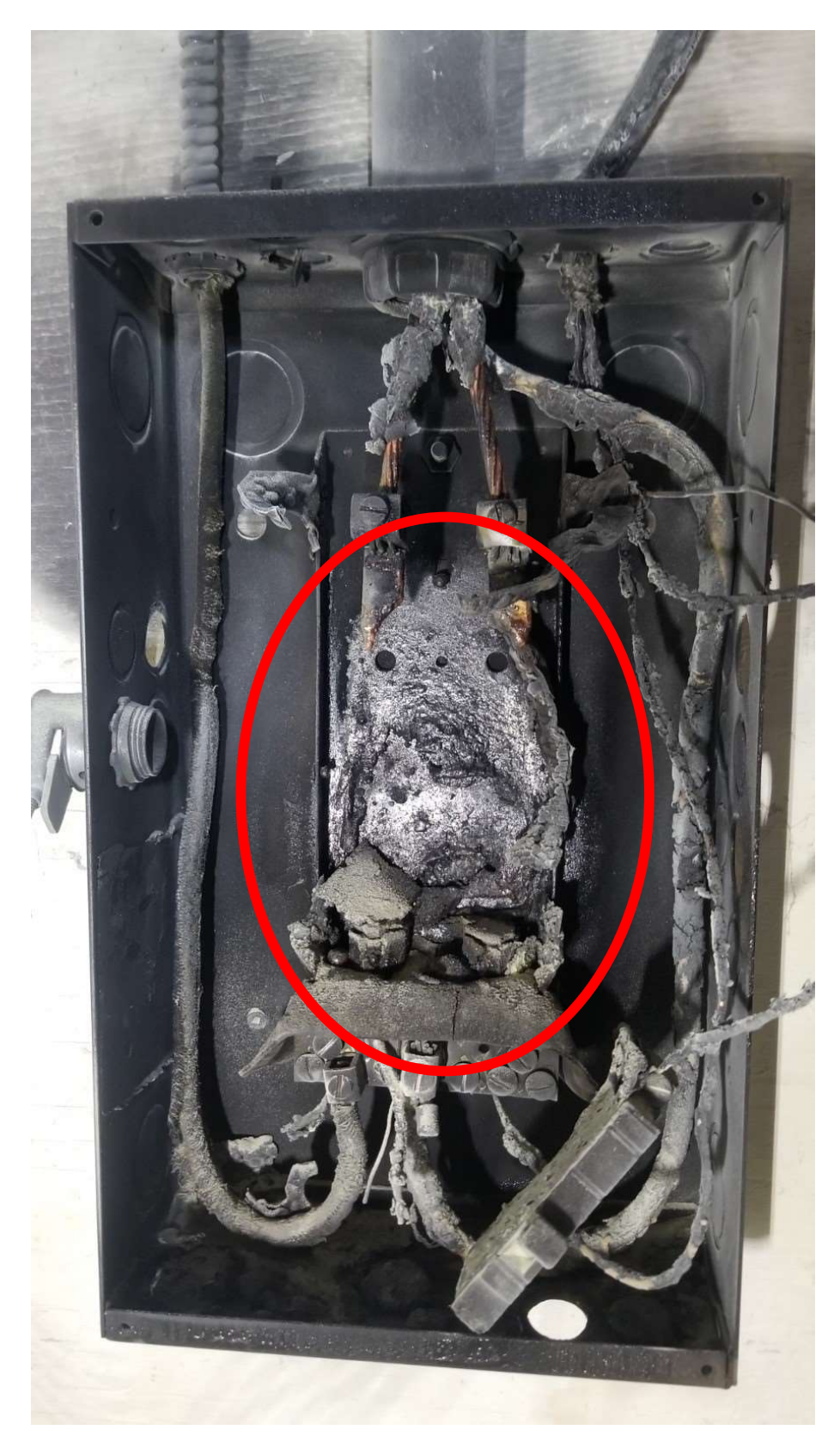
Photo taken of the inside of the panel after the incident. Observe within the red - the area of the large fault occurrence and rapid energy release.