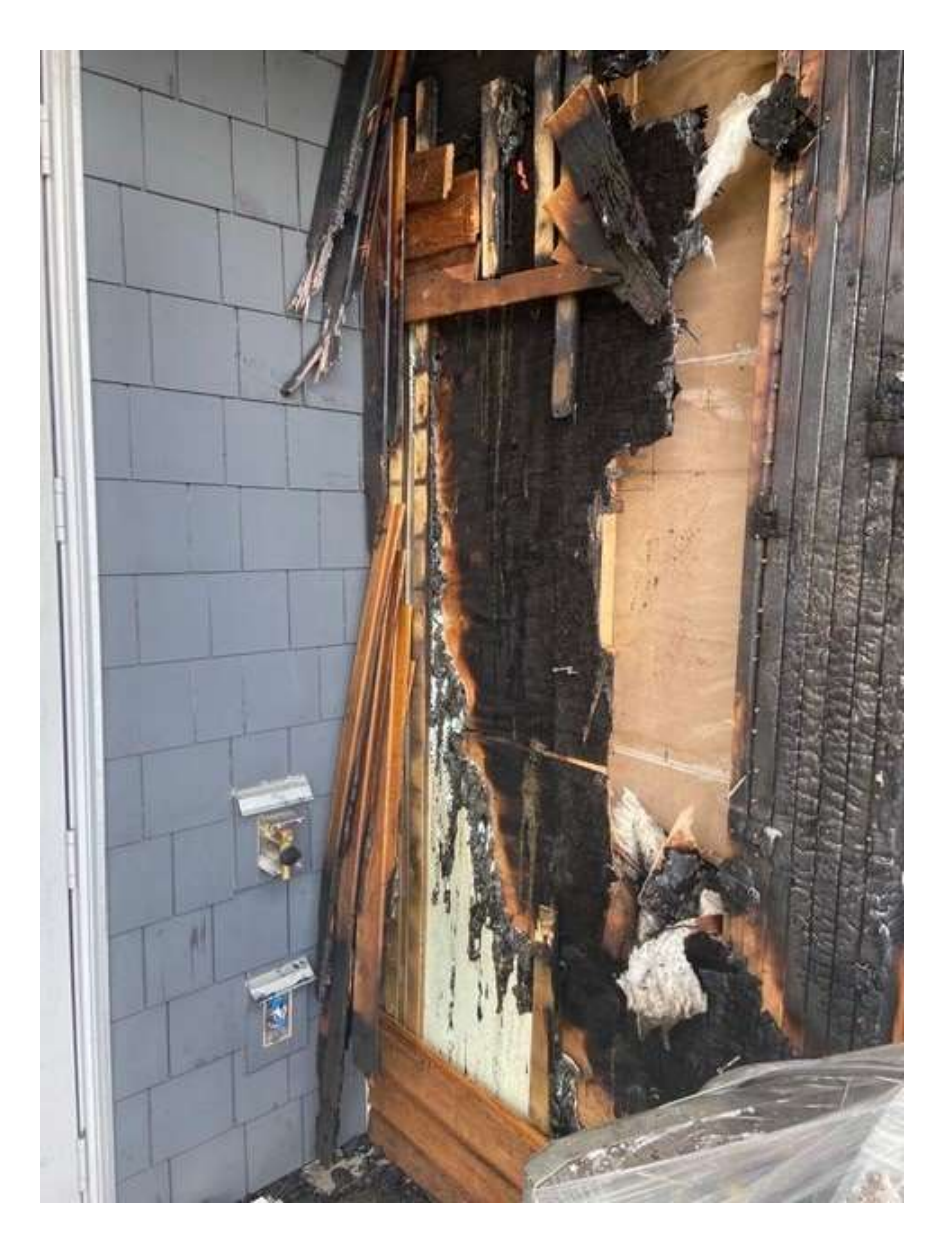
Image 1 - Damage to party wall where the portable BBQ was being operated