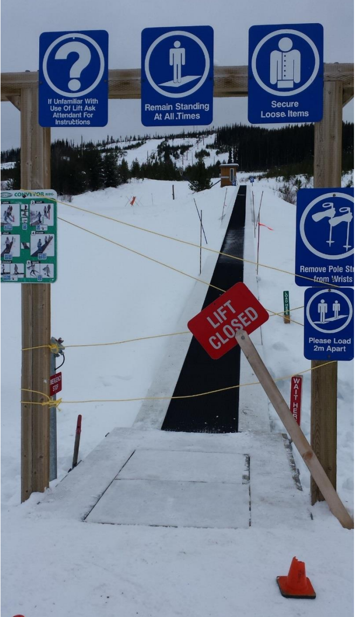
Figure 3: Photograph of the conveyor tail unit with the centre cover plates.