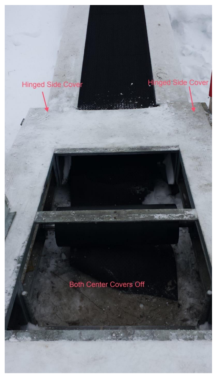
Figure 2: Photograph of the conveyor tail unit without the centre cover plates. The hinged side covers are closed and covered with some snow.