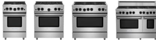
BlueStar Heritage Classic