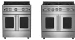
BlueStar Culinary (RCS)