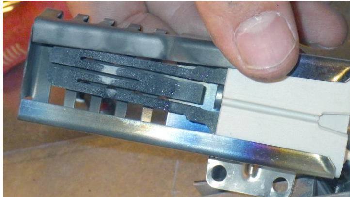
Figure 2 - Oven hot surface ignitor - Good condition