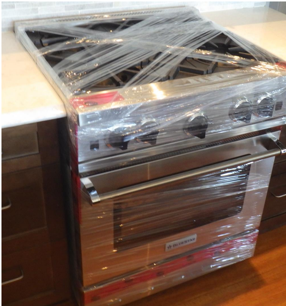
Figure 5 - Final condition of the gas range prior to leaving site