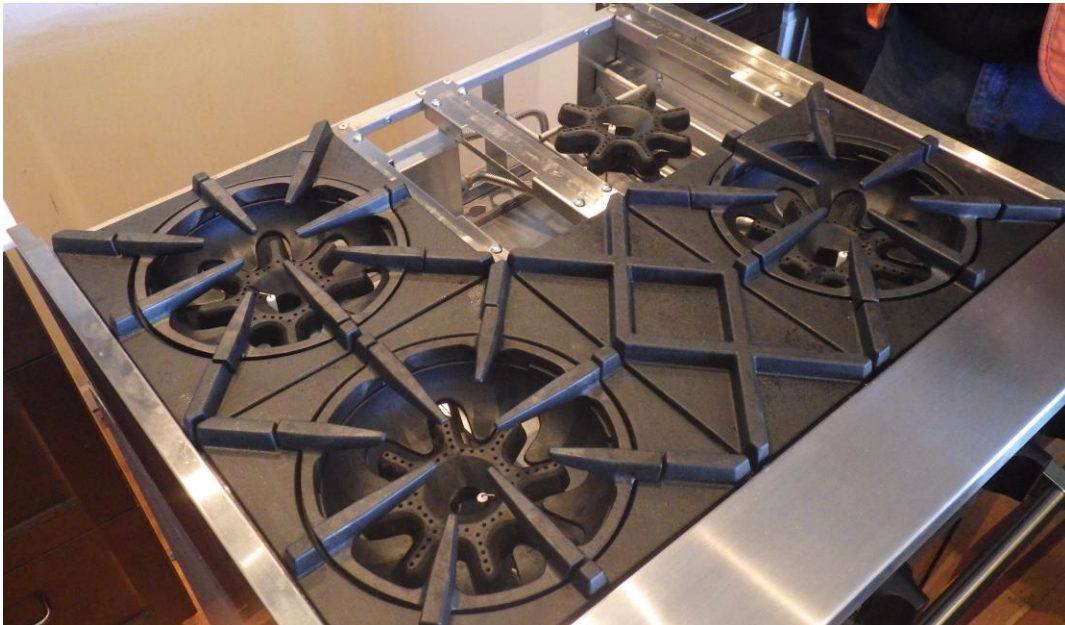
Figure 3 - Top of range with one burner plate removed