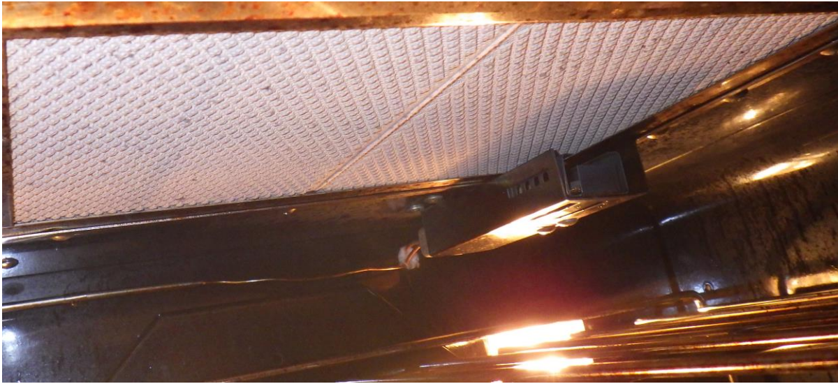
Figure 4 - Infrared broiler with hot surface ignitor