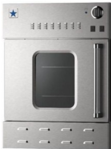
Prizer Painter BlueStar 24-inch Wall Oven