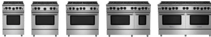
BlueStar Precious Metals Series