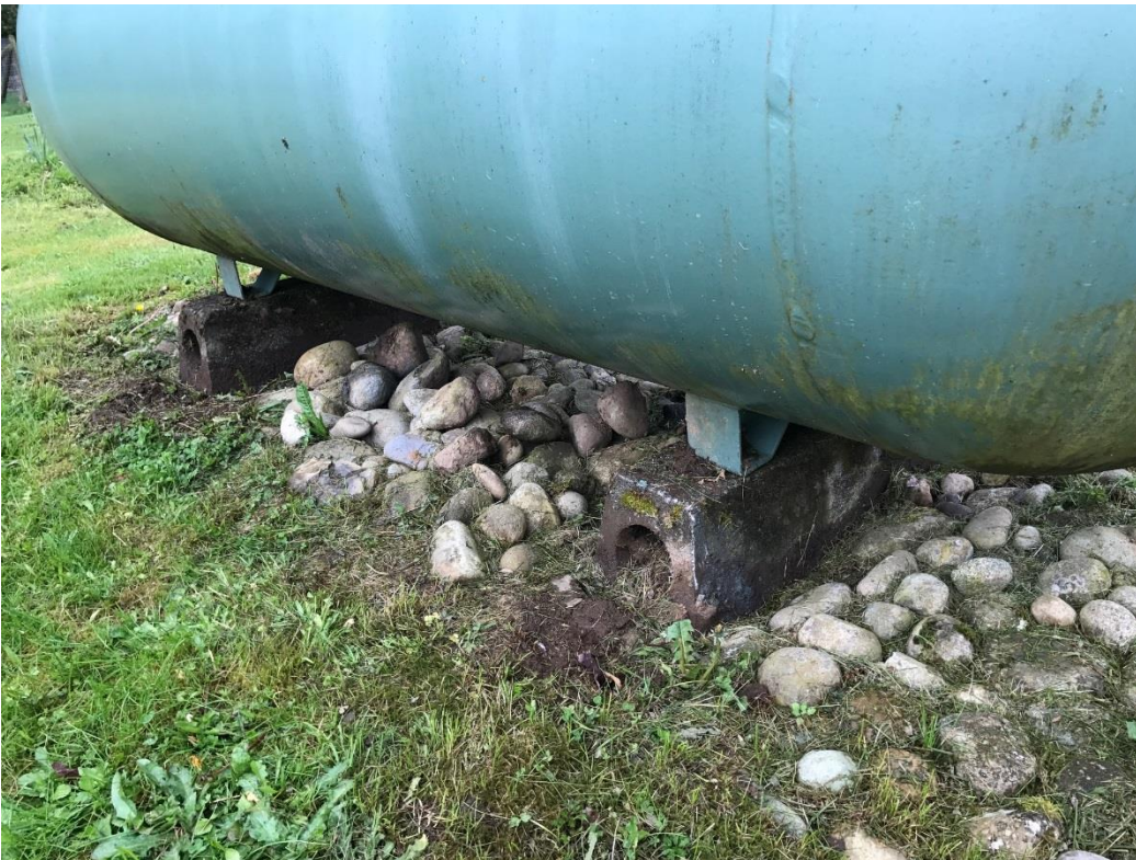
Concrete blocks after repair. Top of this side of the blocks were flush with ground when the tank rolled.