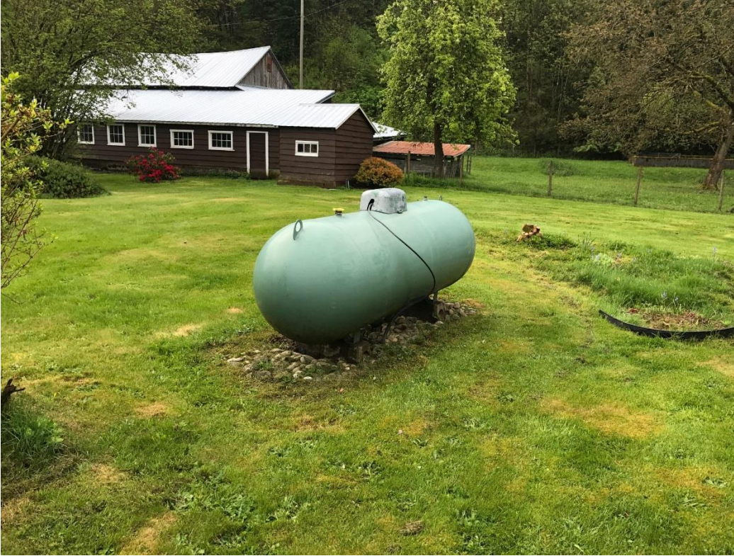
Propane tank after repair