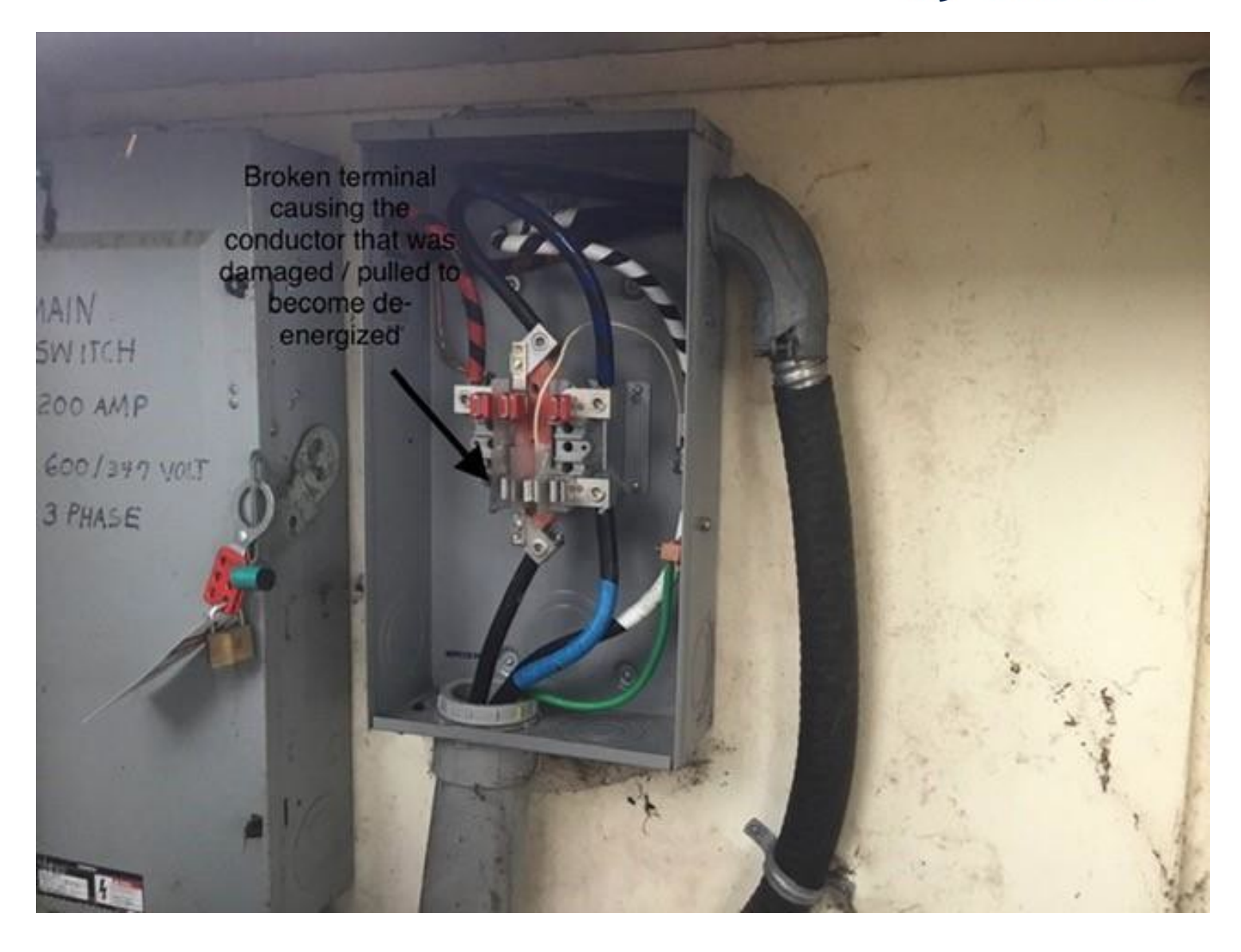
Image 2 - Location of power feeding the underground system that was damaged and the terminal that was broken off by force causing the conductor to be de-energized.