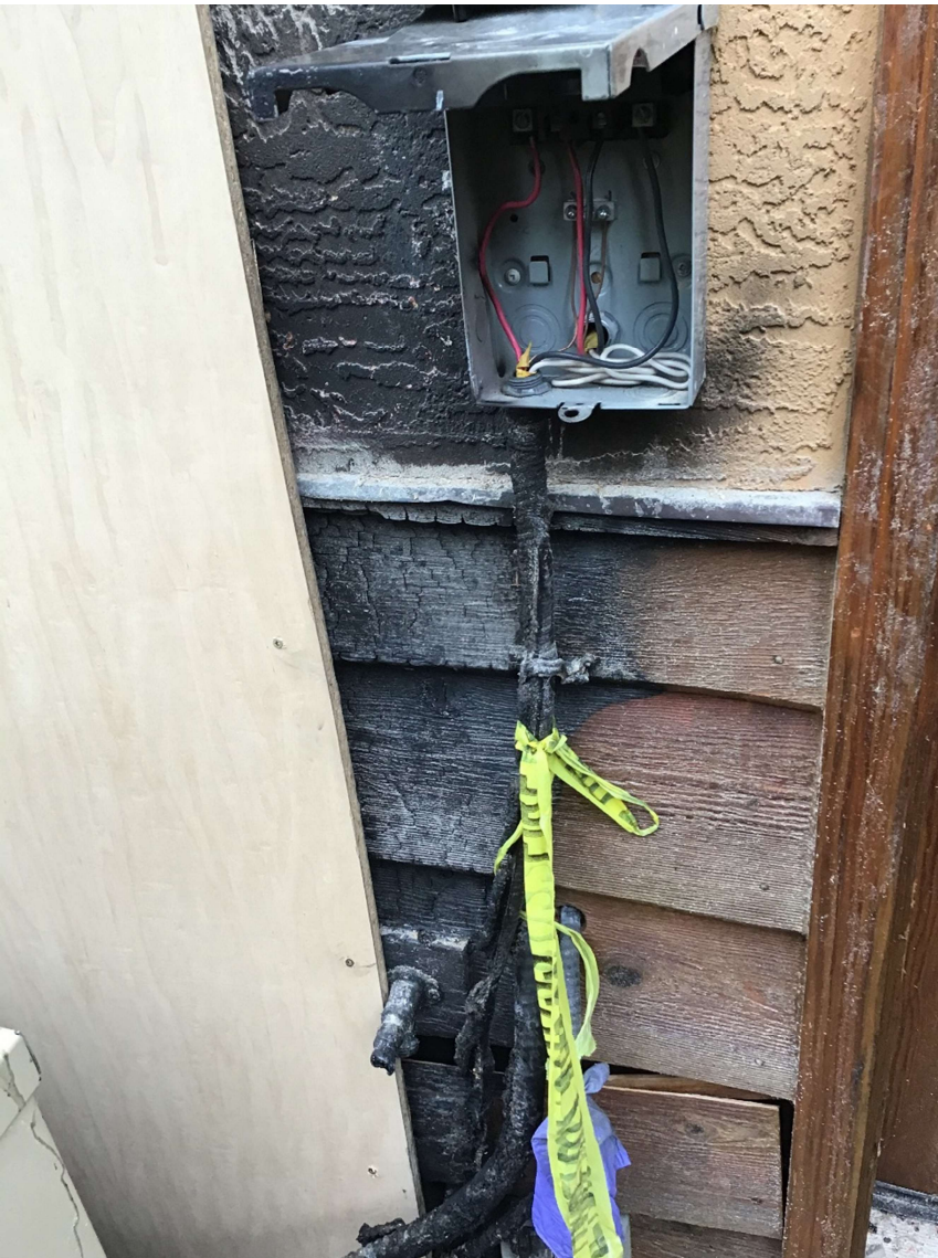
Air Conditioning disconnect location next to Generator, load side cable fire damaged