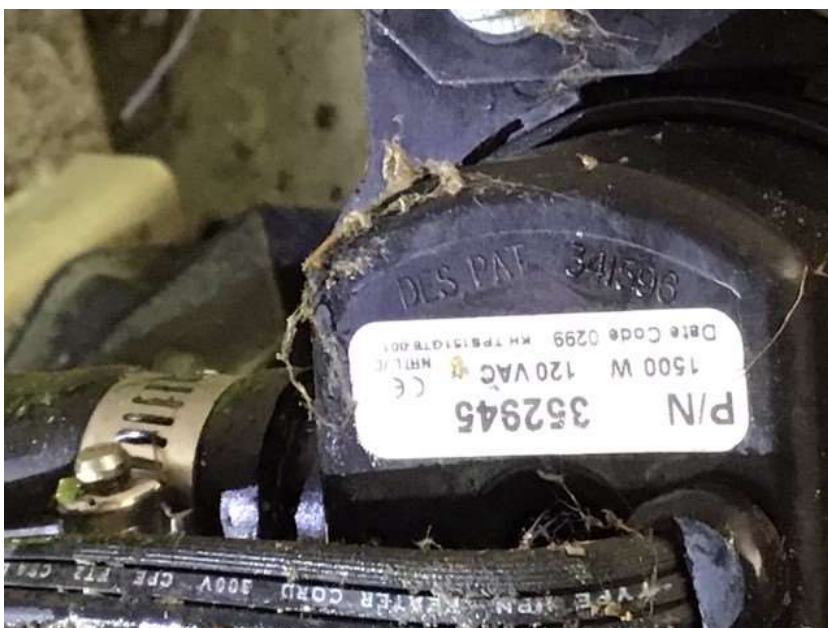
Generator Coolant Heater part number