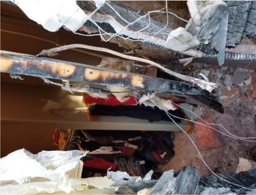
photo provided by Contractor showing pic from exterior of dwelling. The Hot Tub cable is burnt off at below right side of photo and the exterior receptacle branch circuit cable is strung through burnt stud