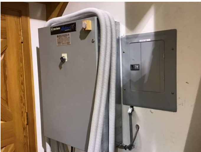
Back up power Auto-transfer Switch and panelboard located just inside door exiting to Generator location.