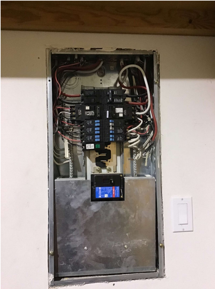
Main Electrical Panel located in garage.