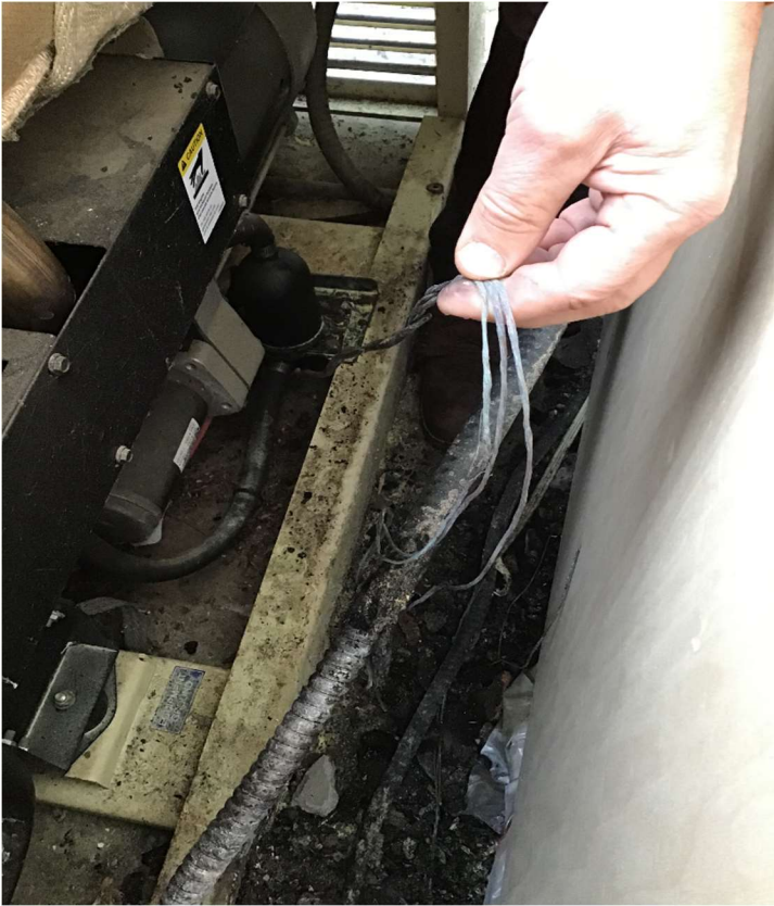
Generator Coolant heater cord burnt