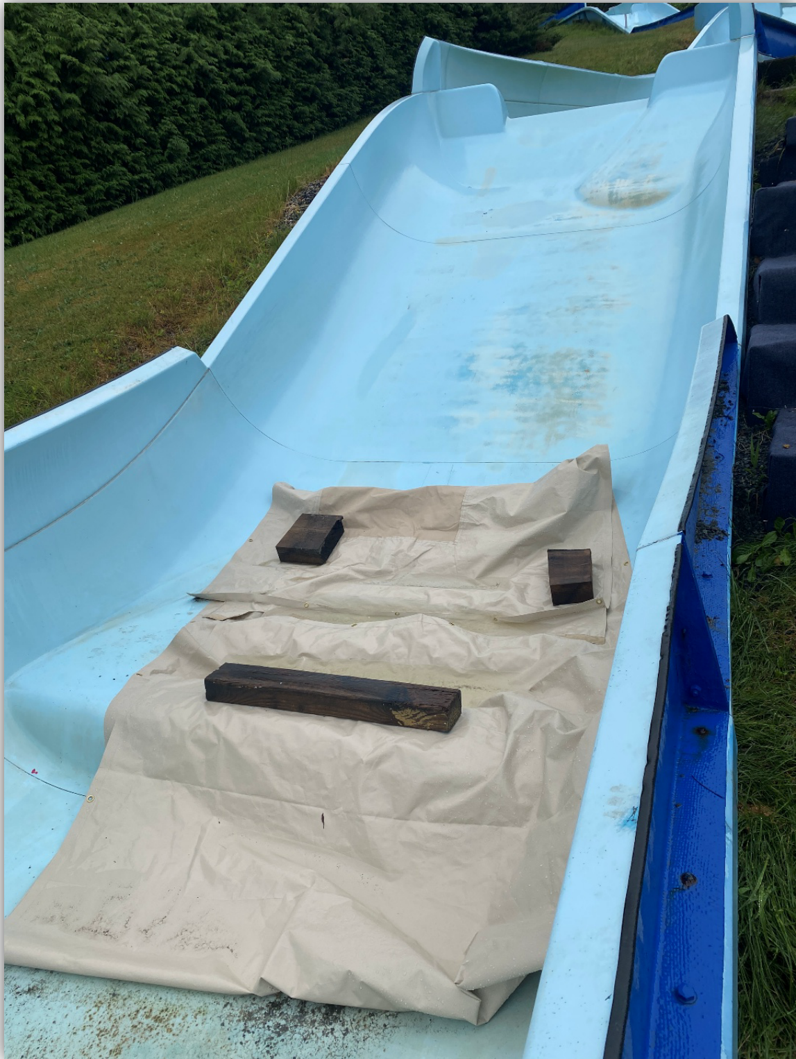
Image 2 – Area of the tube slide failure covered in a tarp at the time of inspection.