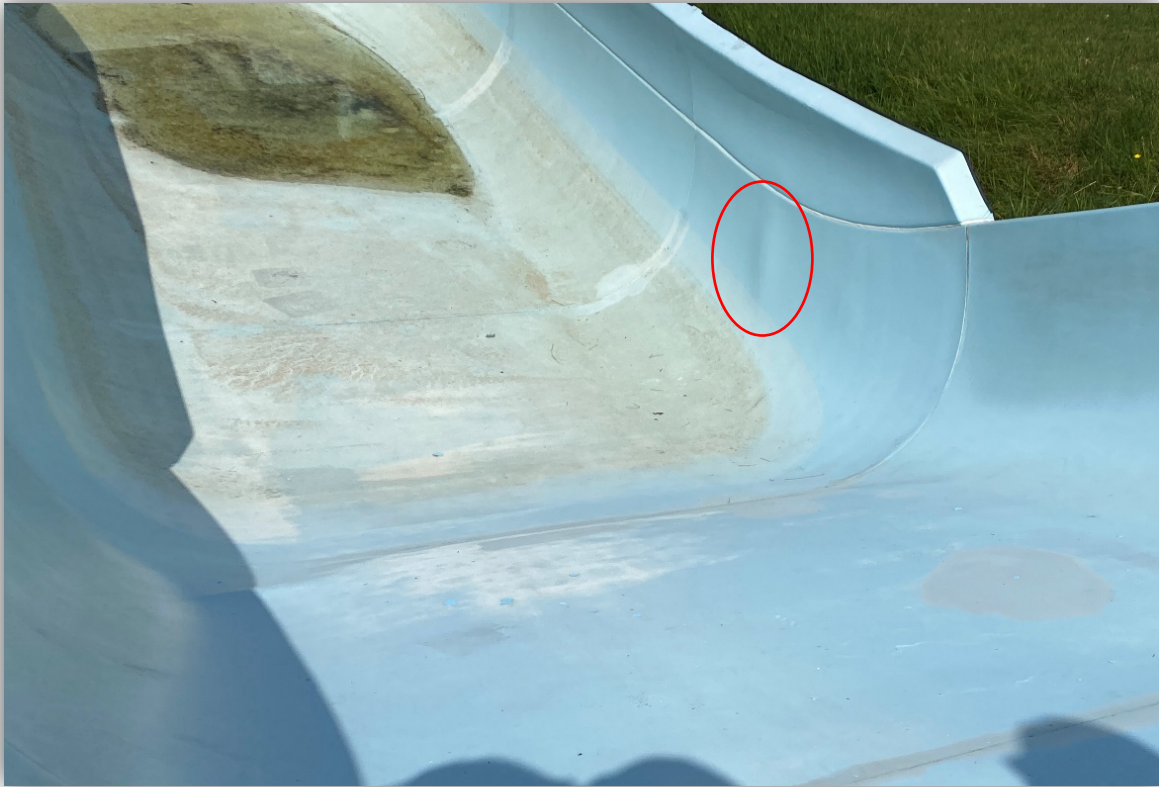
Image 8 – Ground contours pushing in and deforming the fiberglass.