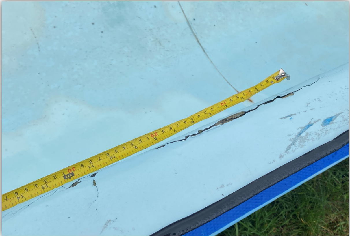
Image 15 - A cracked fiberglass pool edge.