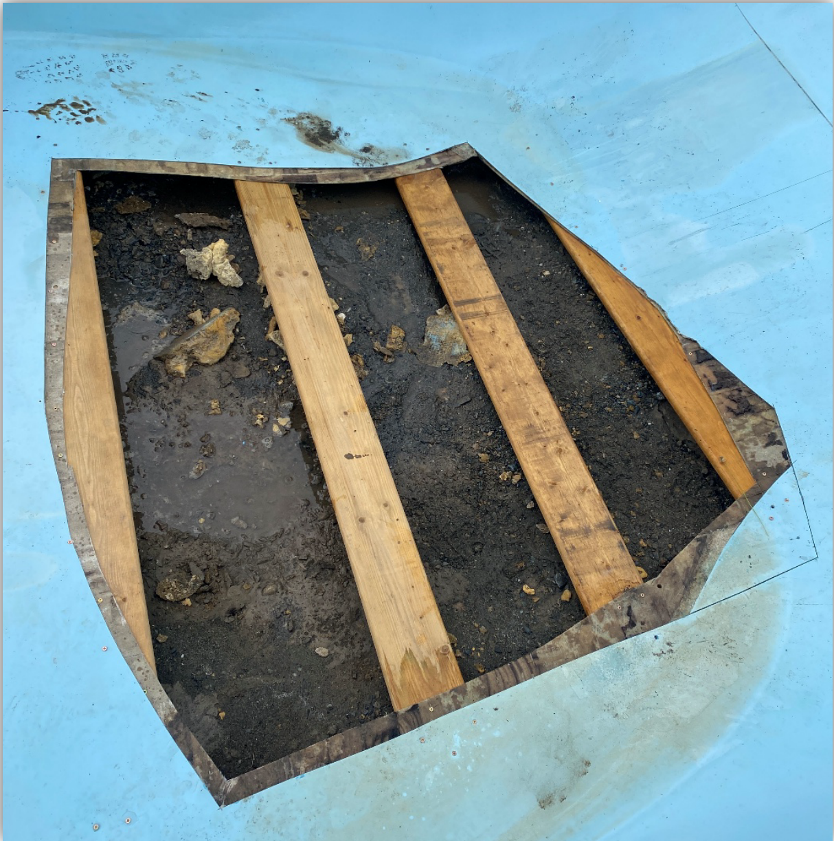
Image 3 - Failed section removed at the time of inspection. The void beneath the slide was up to 5 inches in some areas.