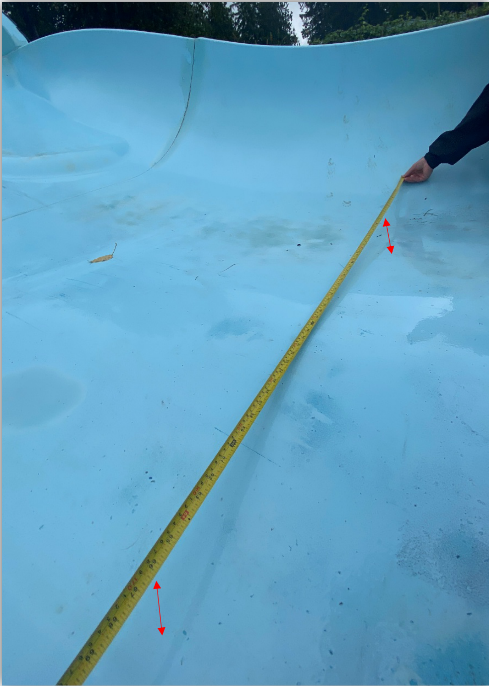
Image 7 – Measuring tape held flat to show the extent of bubbling from the area shown in Image 6.