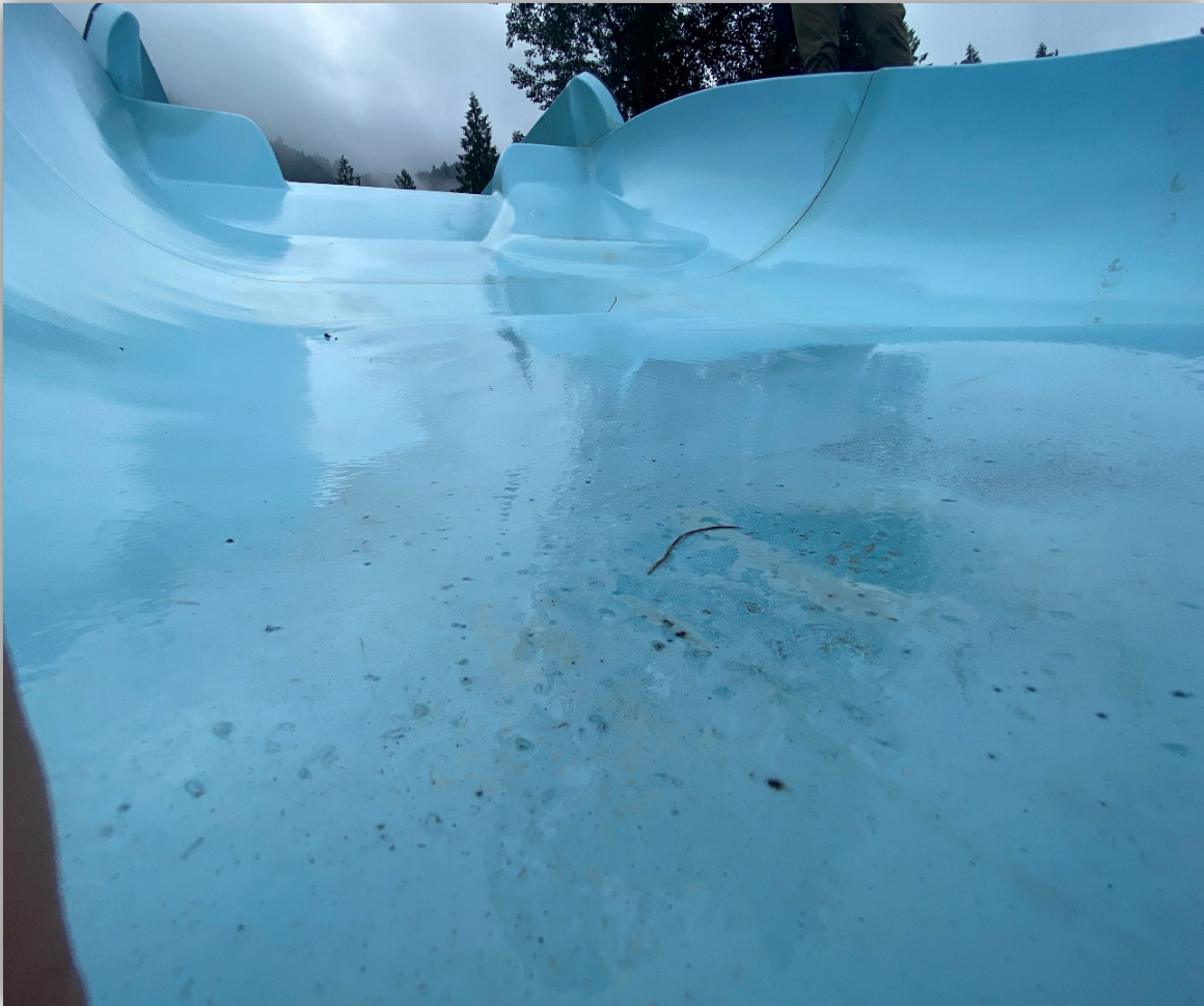
Image 6 – Side view of another bubbled section on a separate section of flume.