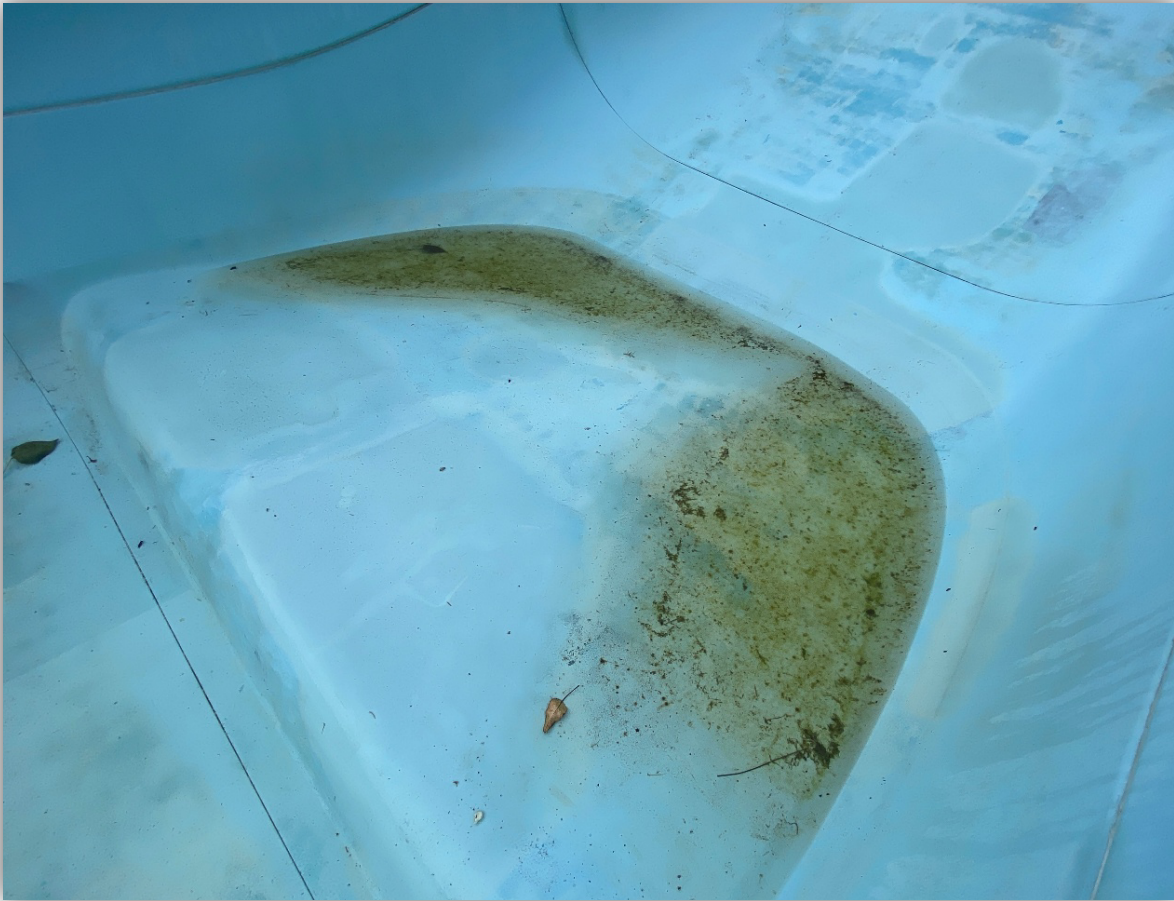
Image 5 – Bubbled section of flume as shown by the water pooling at the edges.