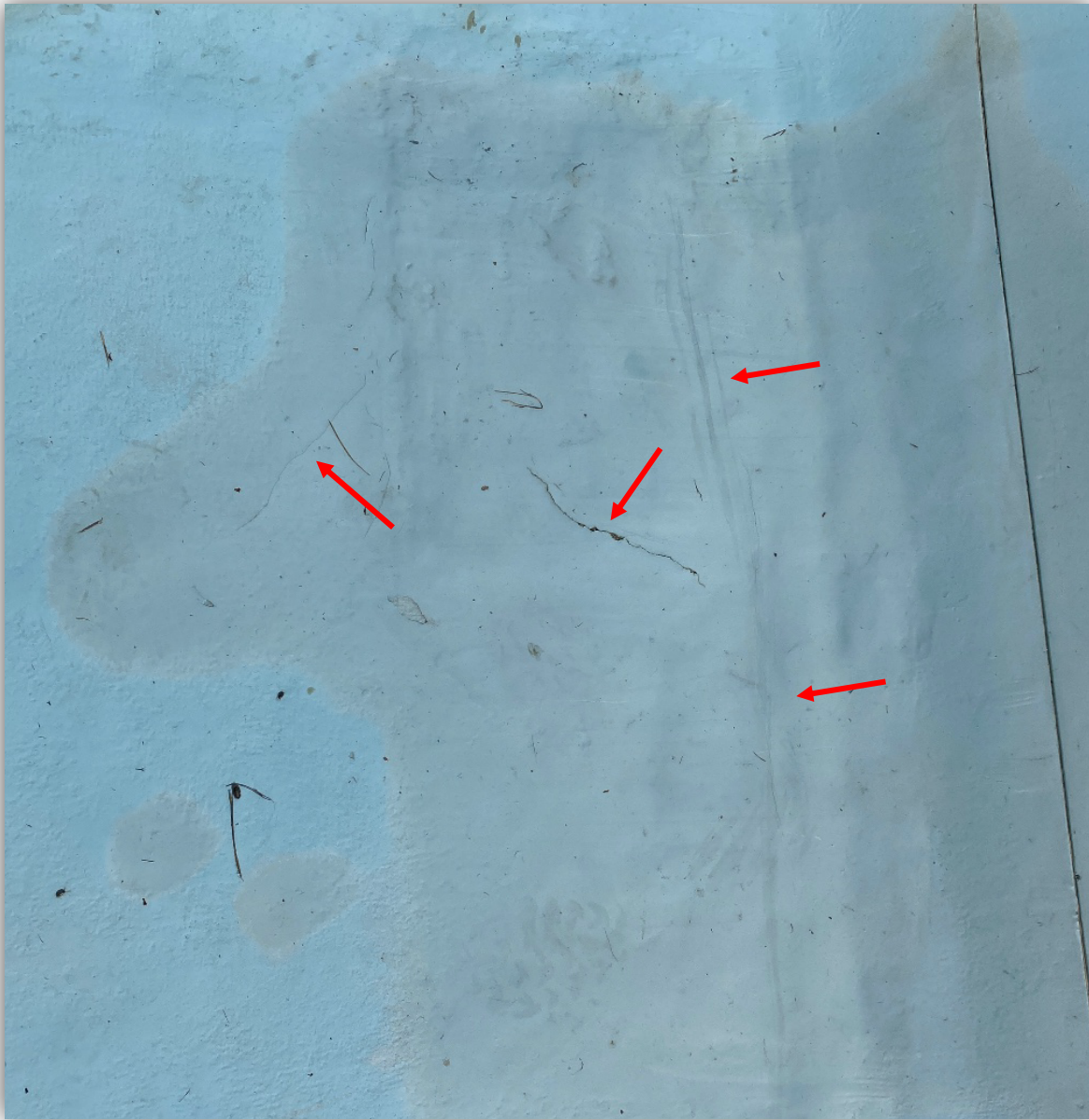
Image 10 – Patched and cracked section at the bottom of a sloped flume. Cracks highlighted with arrows.