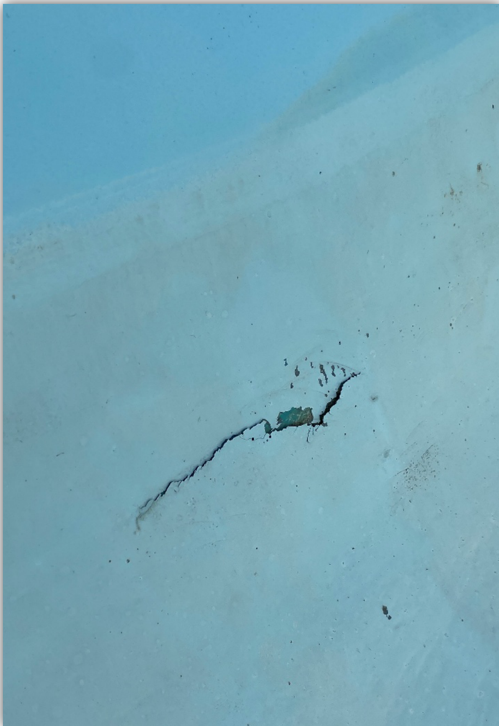
Image 14 – A crack located on the side of a fiberglass pool section.