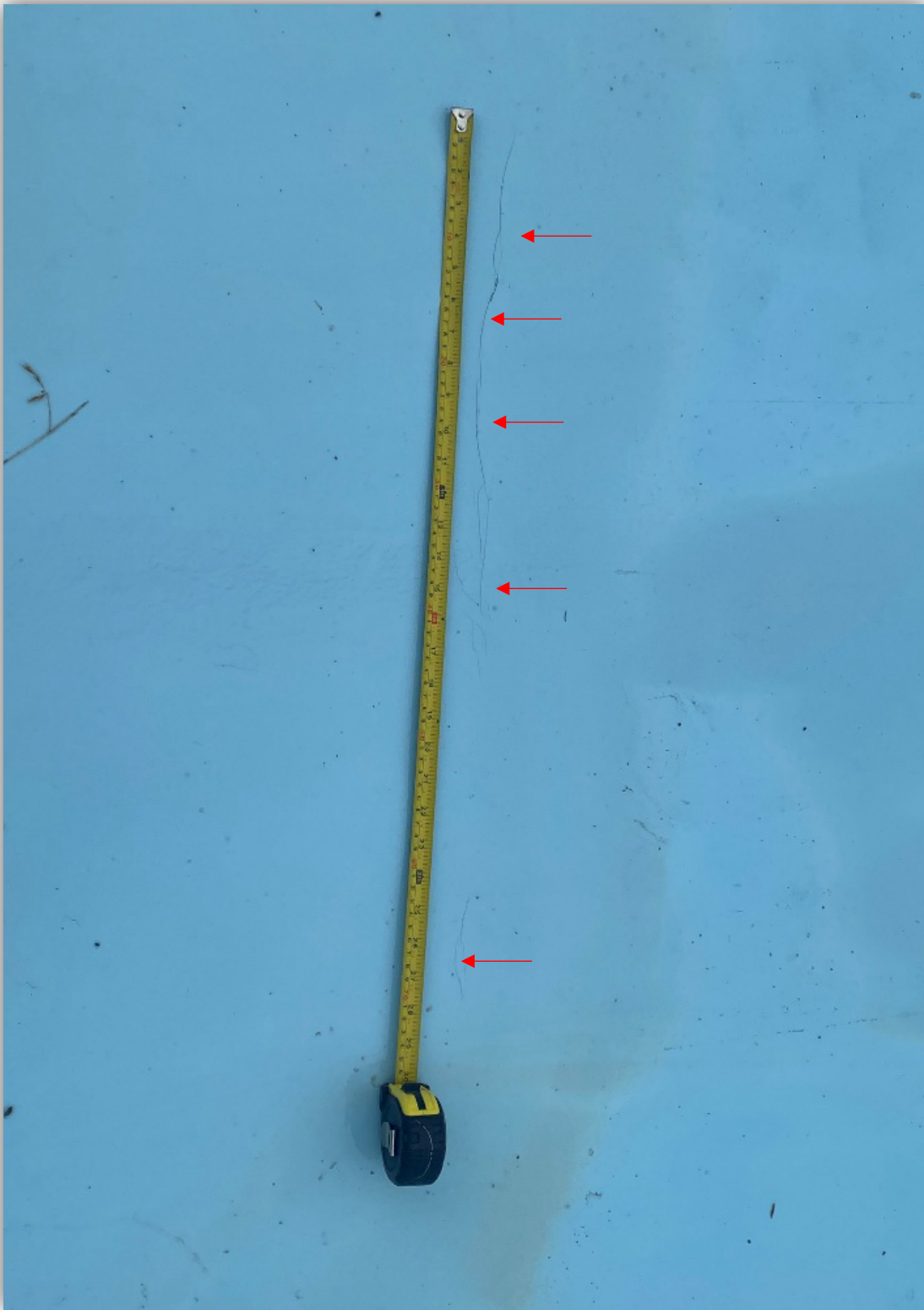
Image 12 – Another crack located at the base of a sloped flume section.