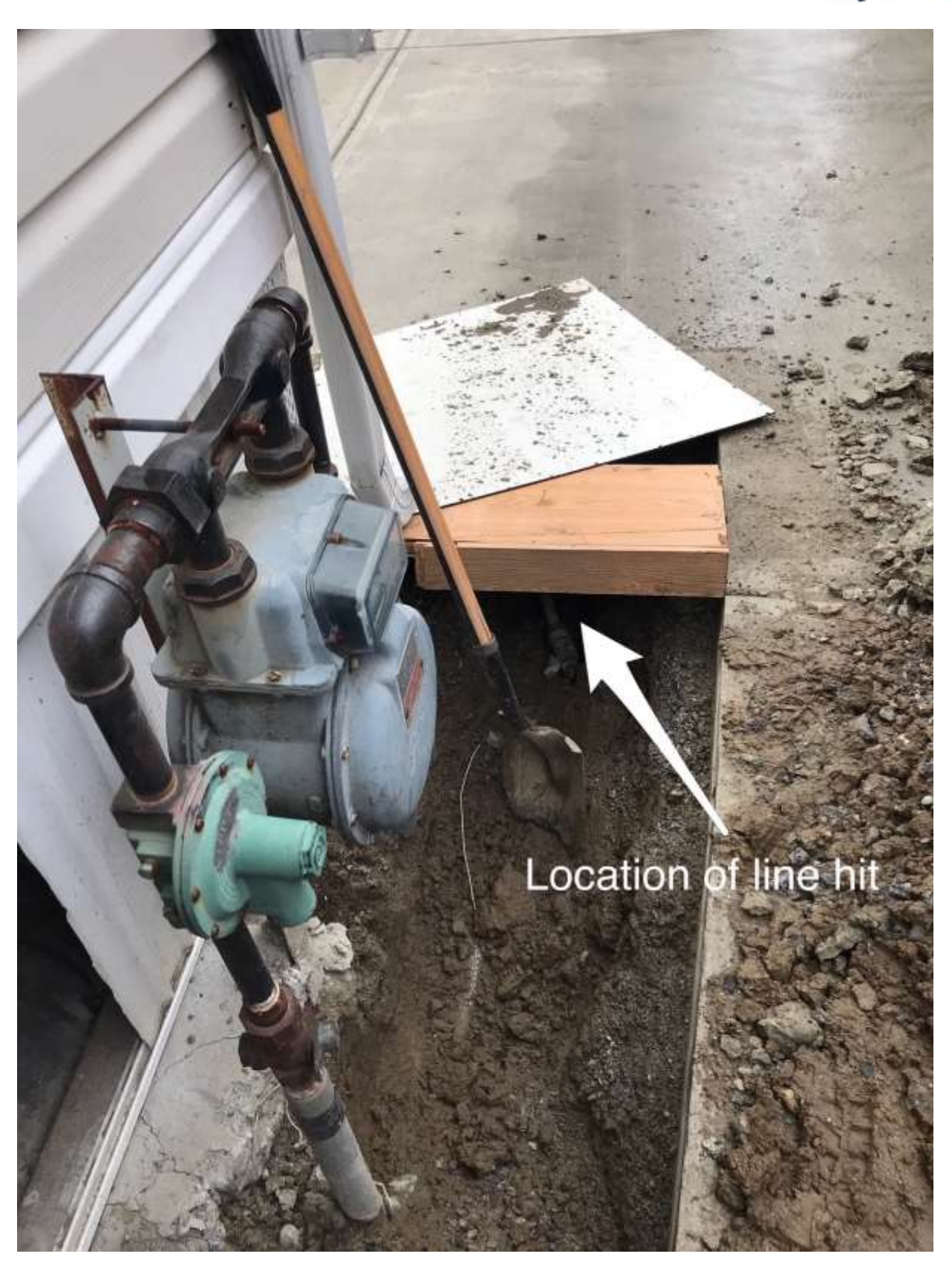
Propane gas meter and location of line hit.

Technical Safety BC www.technicalsafetybc.ca