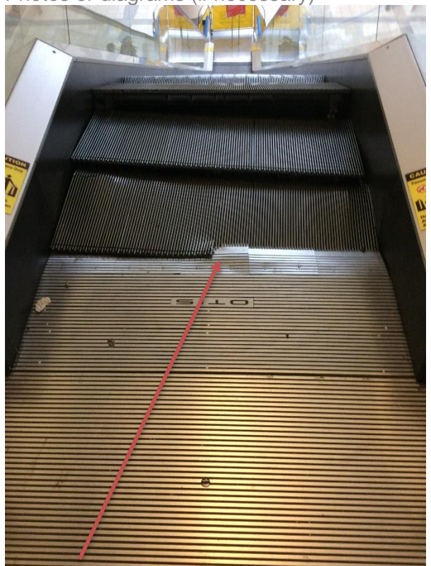
Steps piled up into upper combplates.