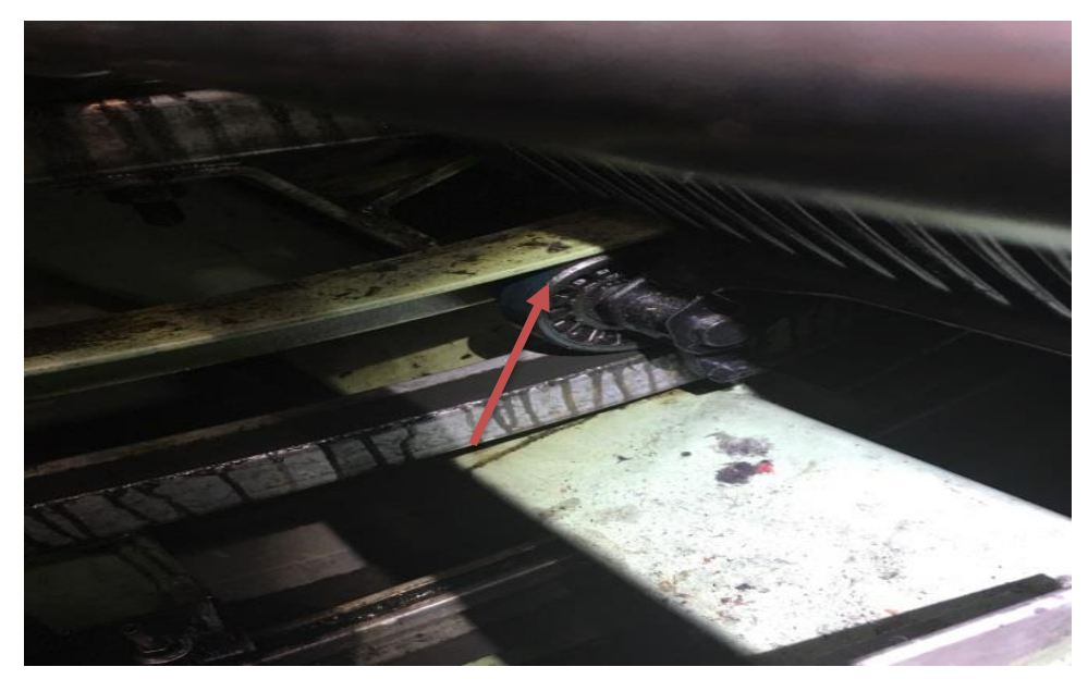
Example of a properly adjusted upthrust track, showing the correct clearance.