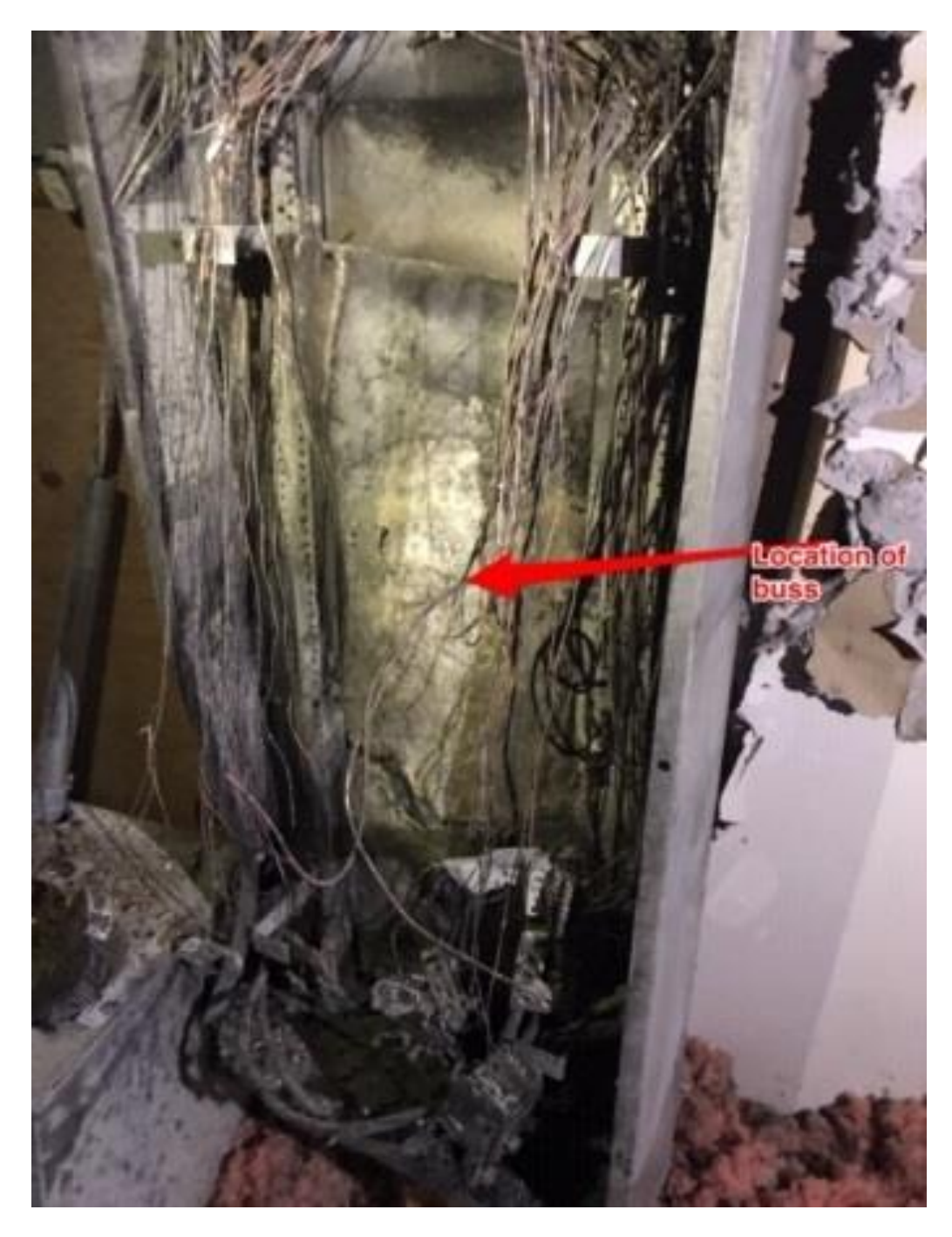
Photograph 1. Showing buss location